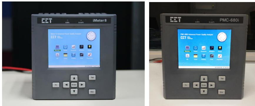
March 2013 – April 2013